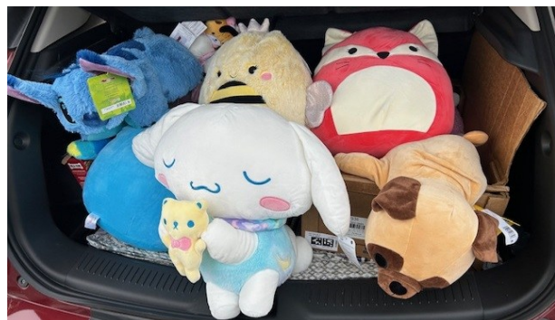
Soft, cuddly and weighted stress toys for kids