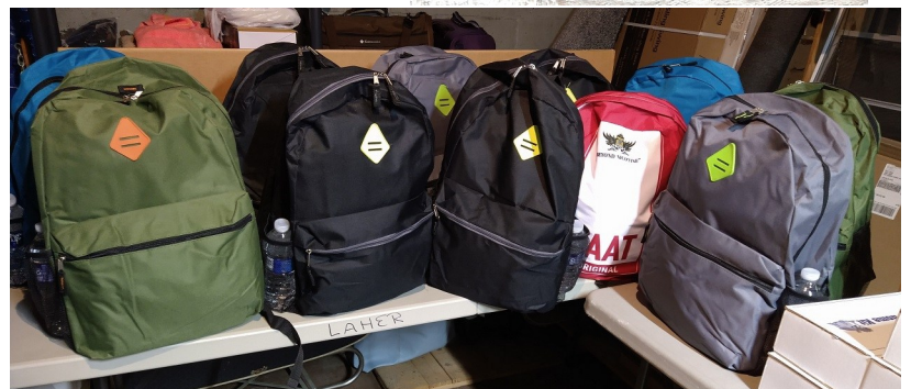
Here is a sample of the backpacks for the homeless