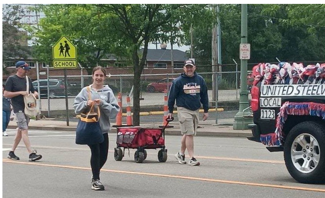
2026 Memorial Day Parade— Downtown Canton, Ohio