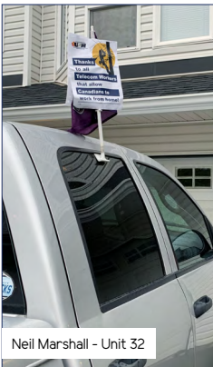
Neil Marshall - Unit 32