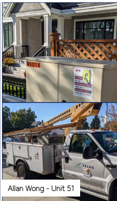
Allan Wong - Unit 51

Remember, you have the right to put Union material on your Union Board, company truck, at your desk if you still work out of an office, or anywhere you are presently allowed to post personal items.