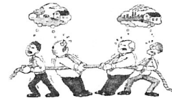
Plate Mill Department Issues

We thank you for your continued support and involvement with our safety committees to make our plant a safer place to work and to help us achieve of our goals and objectives.