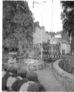
Hilton Garden Inn

Come join us for our annual meeting, and stay to enjoy the many activities Saratoga has to offer. We'll gather together again in the evening at one of Saratoga's fun pubs, The Irish Times to share some light refreshments.